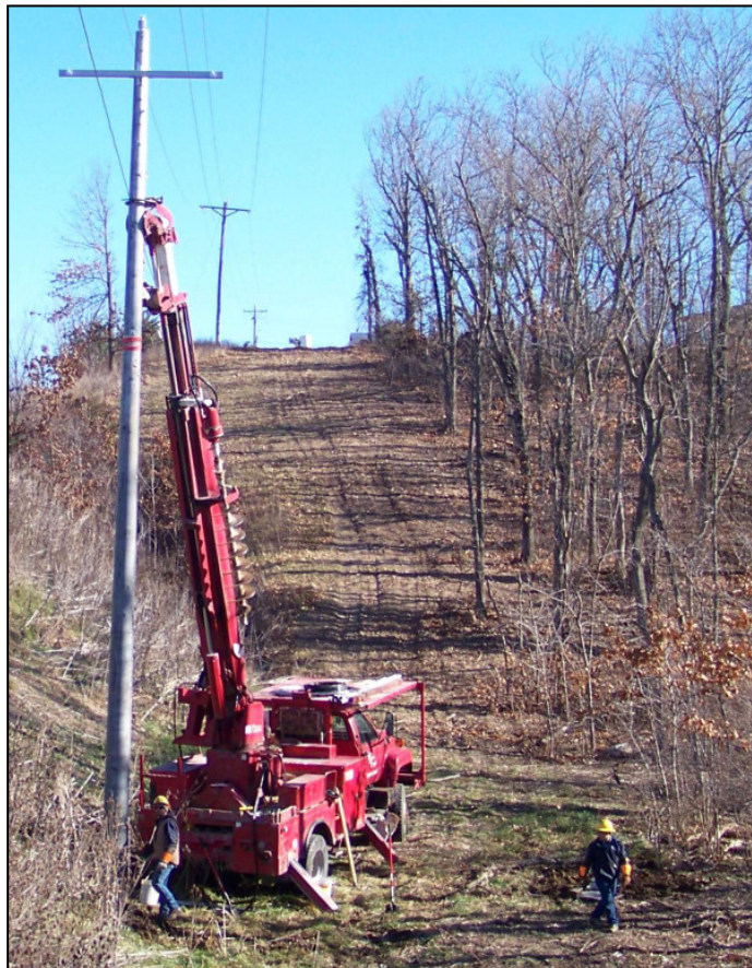
STANDING STRONG...Concrete poles are installed by a West Central Electric contractor along Highway DD between Warrensburg and Knob Noster.

VEHICLE IDENTIFICATION... All WCE employees and contractors will drive vehicles with signs identifying them as a WCE vehicle (top photo) or a contractor for the cooperative (left photo).