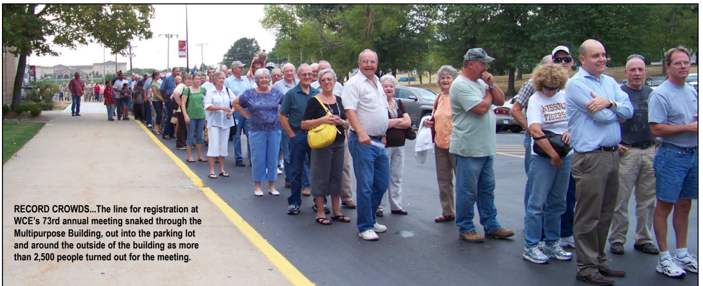
RECORD CROWDS... The line for registration at WCE's 73rd annual meeting snaked through the Multipurpose Building, out into the parking lot and around the outside of the building as more than 2,500 people turned out for the meeting.