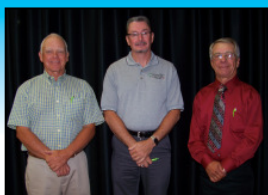
WCE members elect directors during cooperative's 72nd annual meeting...page 2