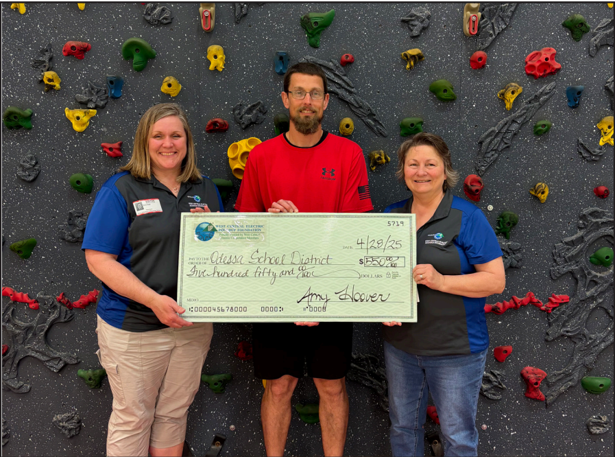
Odessa School District $550 Grant will provide funding for a Fly Fishing for Beginners project.