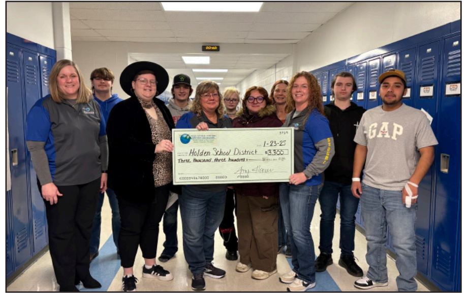
Holden School District $3,300 Grant will be used to help set up WINGS Academy, the district's alternative school classroom.