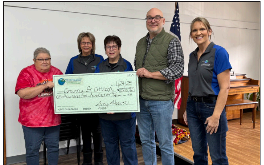
Concordia Senior Citizens Organization $1,500 Grant will be used to help fund the center's kitchen project.