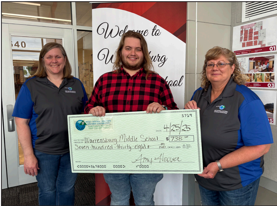
Warrensburg Middle School Choir $738 Grant will be used to purchase a Harmony Director keyboard.