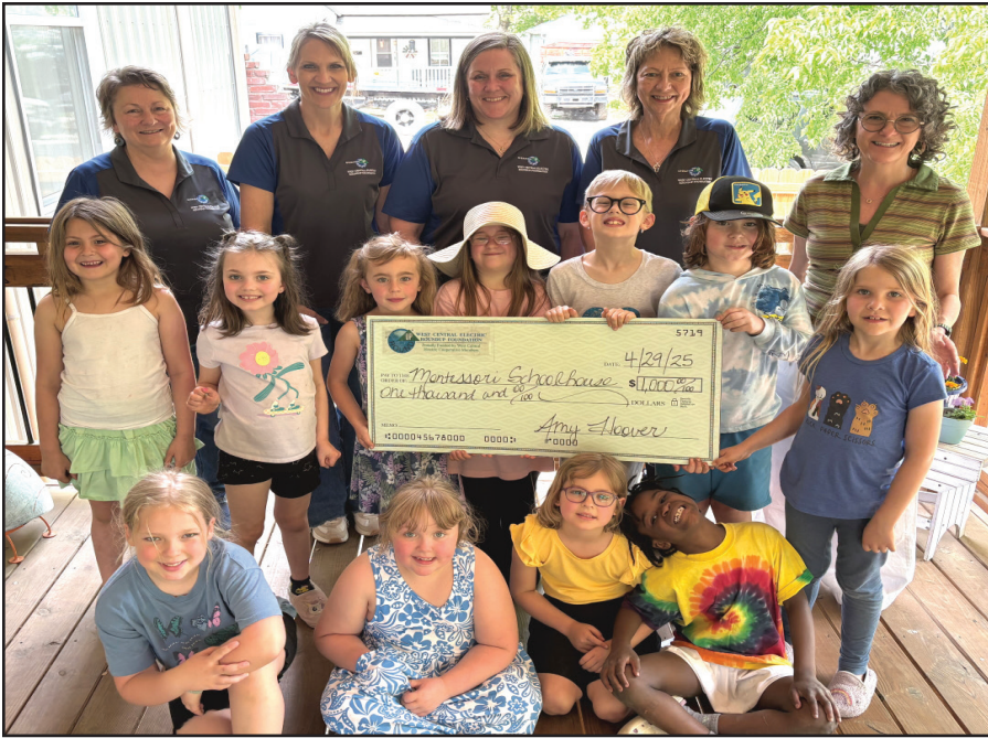
Higginsville Montessori Schoolhouse $1,000 Grant will provide funding for the school's Wellness Initiative.