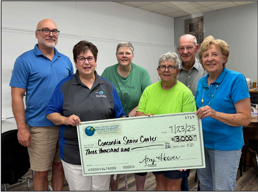
Concordia Senior Center $3,000 Grant will be used to help purchase flooring, ceiling tiles and countertops for the kitchen renovation project.