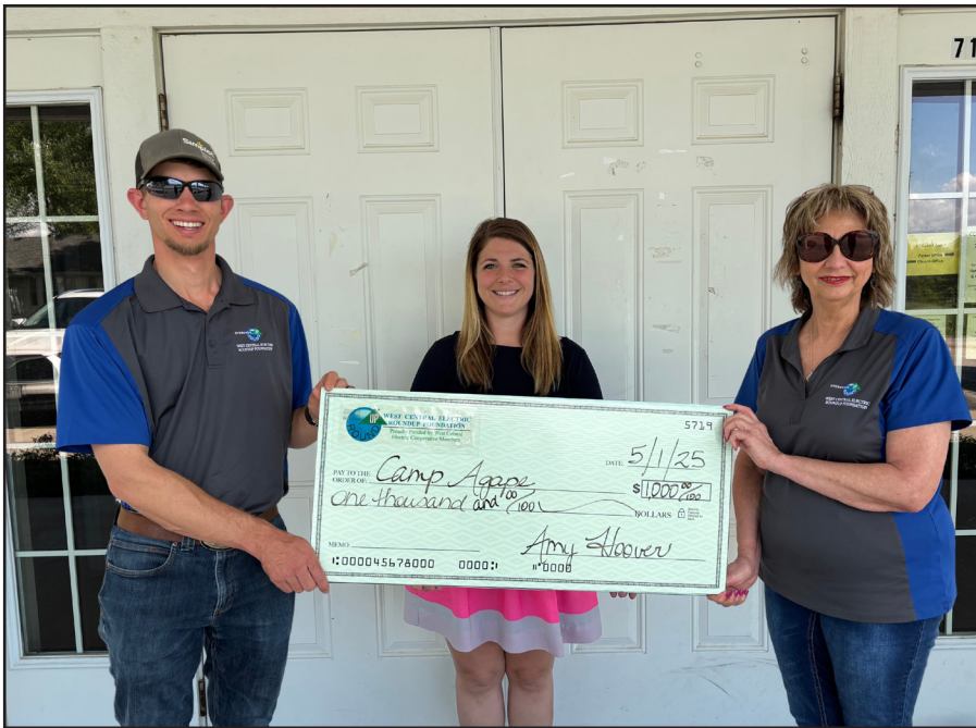
Camp Agape, Wellington $1,000 Grant will be used for summer day camp.