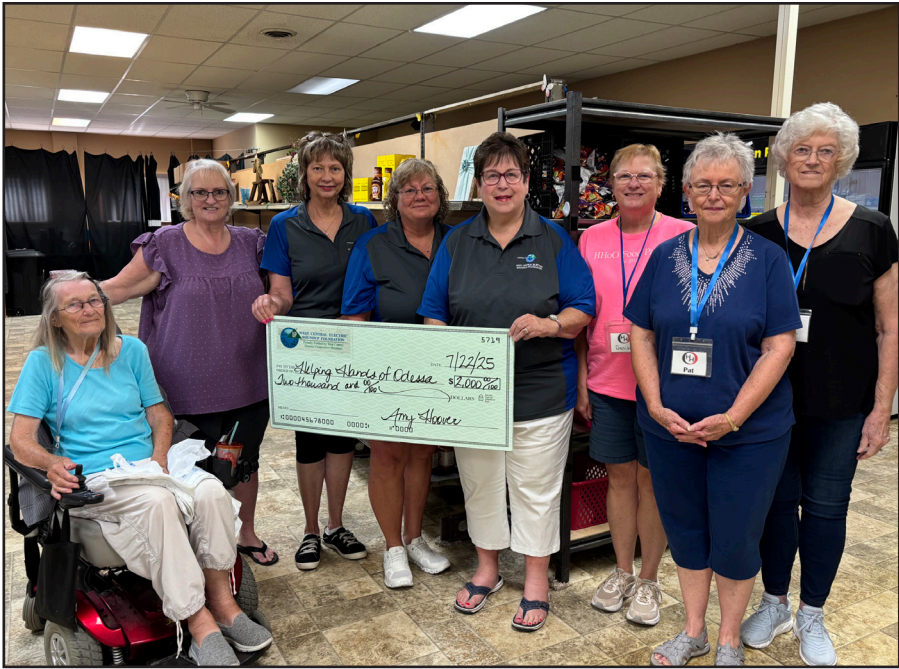
Helping Hands of Odessa $2,000 Grant will be used to replenish food supplies as needs have grown.