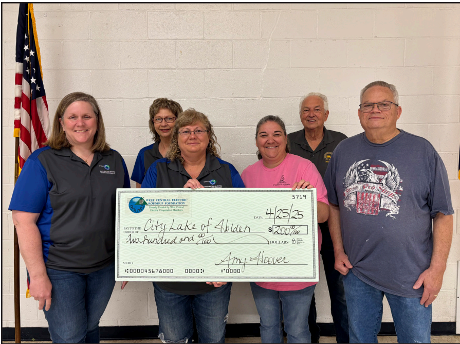
City of Holden Lake $200 Grant will be used for an Expanded Outdoor Experience.