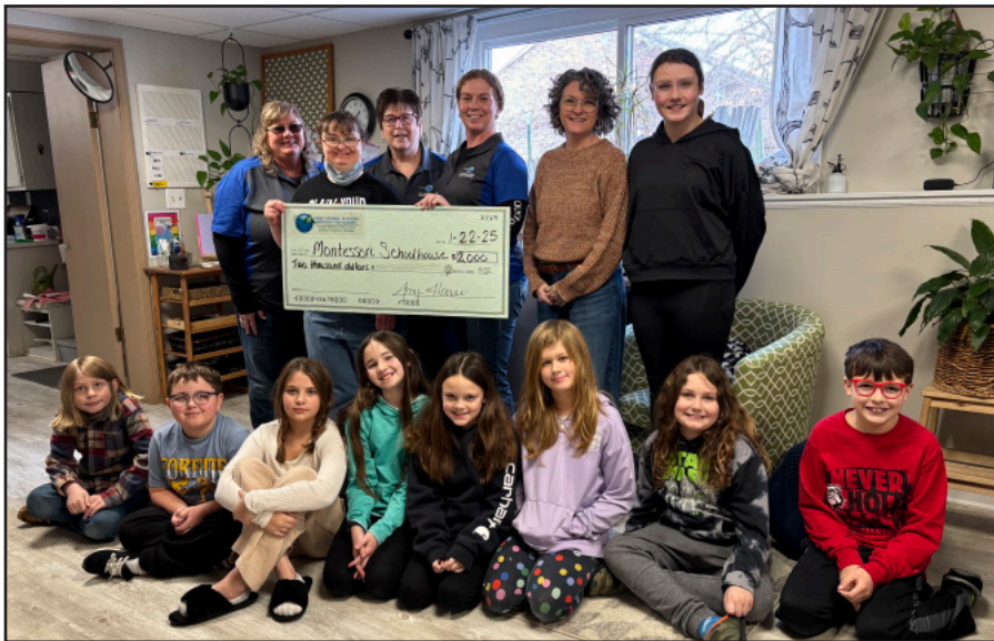
Higginsville Montessori Schoolhouse $2,000 Grant will be used for the school's Wellness Initiative.