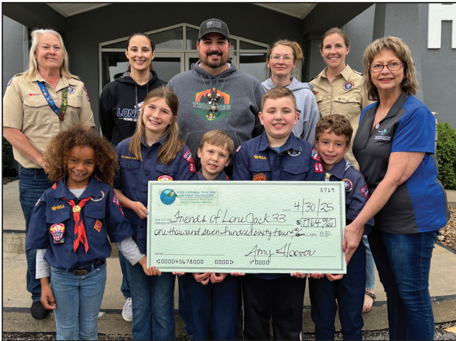
Friends of Lone Jack 33, Inc. $1,764 Grant will be used for a Pinewood Derby track.