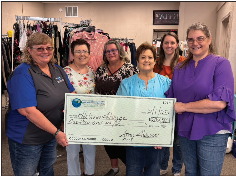
Helen's House $2,000 Grant will help provide clothing and shoes for children in the Odessa School District.