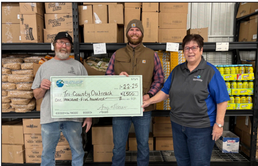
Tri-County Outreach Food Pantry $1,500 Grant will help stock supplies.