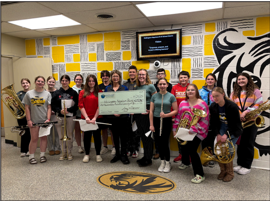
Wellington-Napoleon High School Band $1,670 Grant will be used to purchase a piccolo.