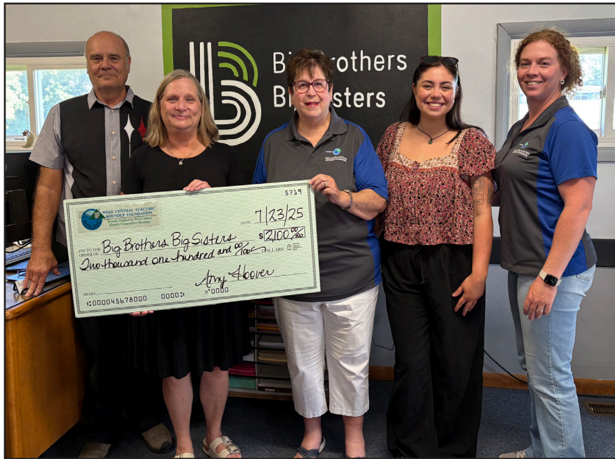
Big Brothers Big Sisters of Johnson County $2,100 Grant will be used for equipment, transportation and fees for participants age 14+ to explore career options.