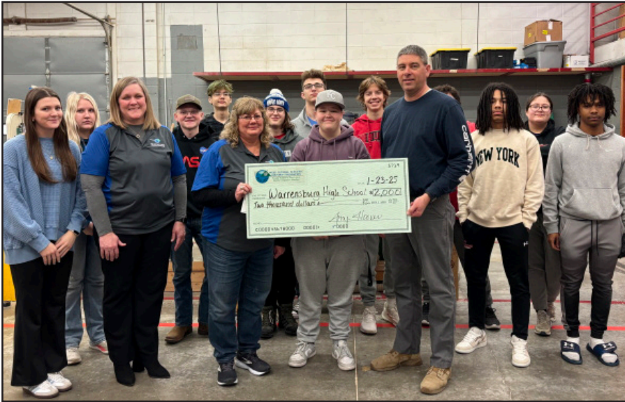
Warrensburg High School $2,000 Grant will be used for updated equipment for the Industrial Technology Department.