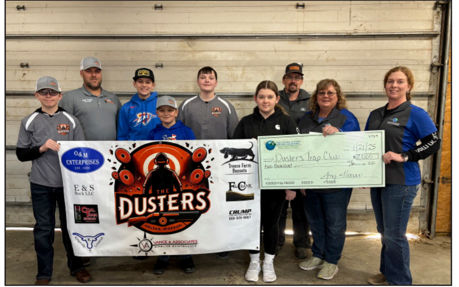
Duster's Trap Club $2,000 Grant will be used to help fund the club's facility electricity project.