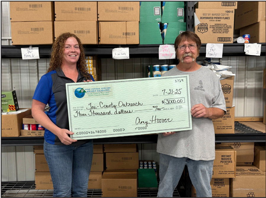
Tri-County Outreach $3,000 Grant will be used to purchase food from Harvester's.