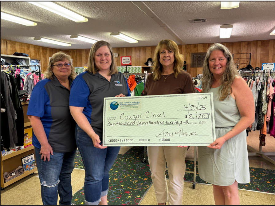
Crest Ridge Schools $2,720 Grant will be used for the school clothes closet.