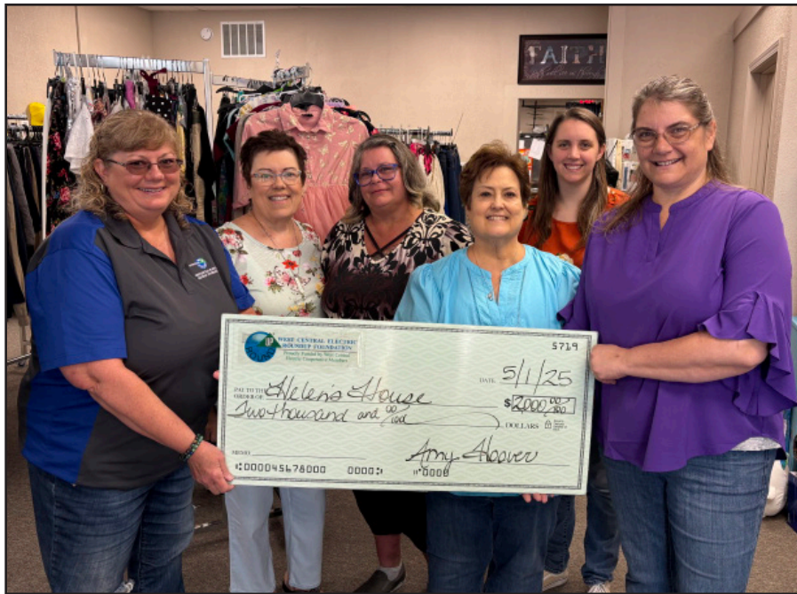
Helen's House $2,000 Grant will help provide clothing and shoes for children in the Odessa School District.