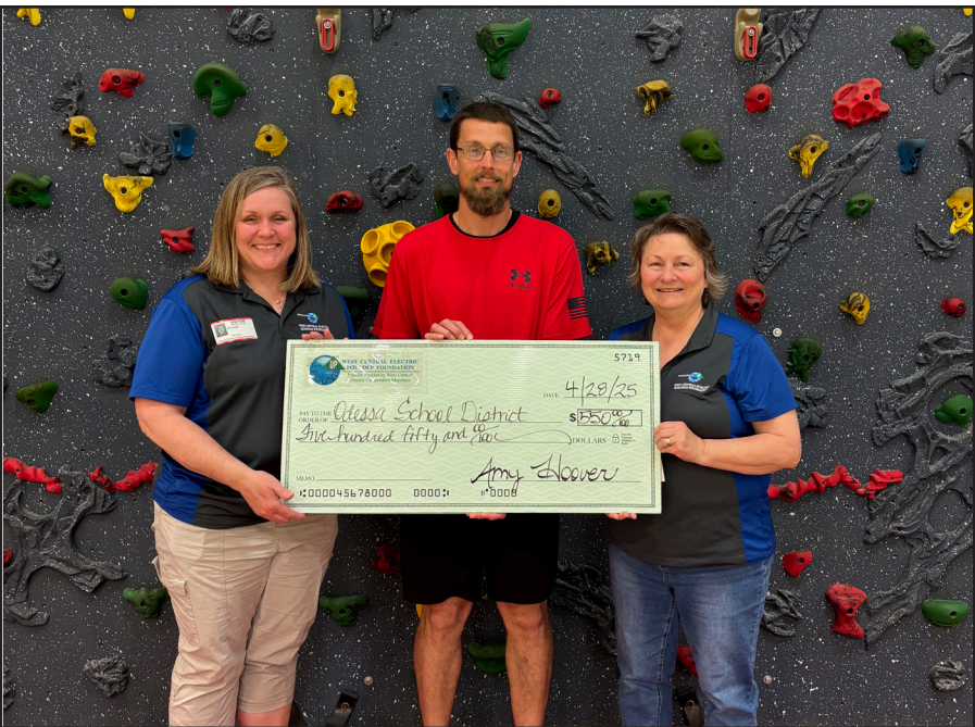
Odessa School District $550 Grant will provide funding for a Fly Fishing for Beginners project.