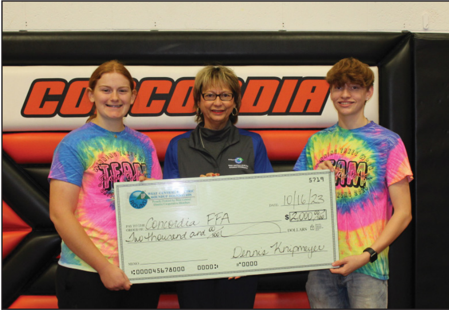
Concordia HS FFA Chapter Meal Programs $2,000