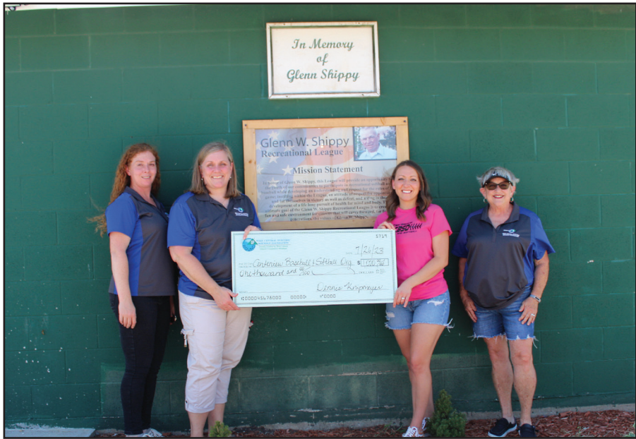
Centerview Baseball & Softball Organization