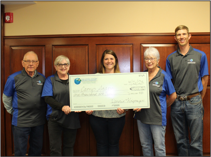
Wellington Comm. Center, Camp Agape