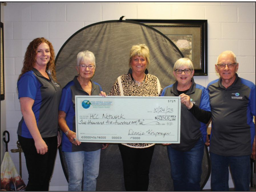
HCC Network of Lafayette County Project Connect $2,500