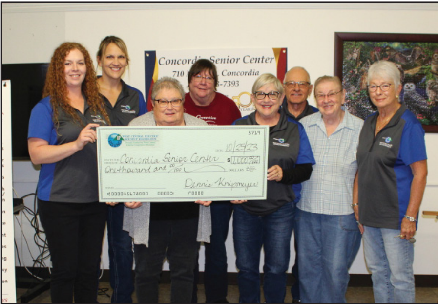
Concordia Senior Center Meal Program $1,000