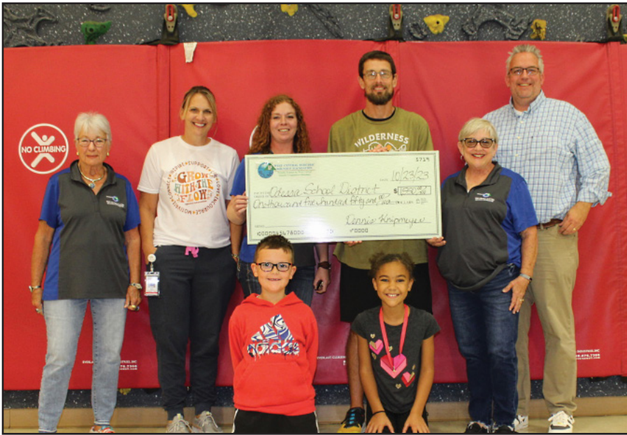
McCrerry Elementary, Odessa P.E. Project $1,550