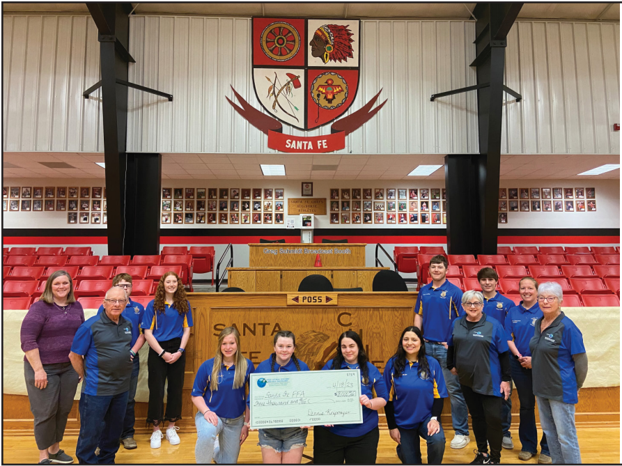
Santa Fe HS FFA, Backsnack Program