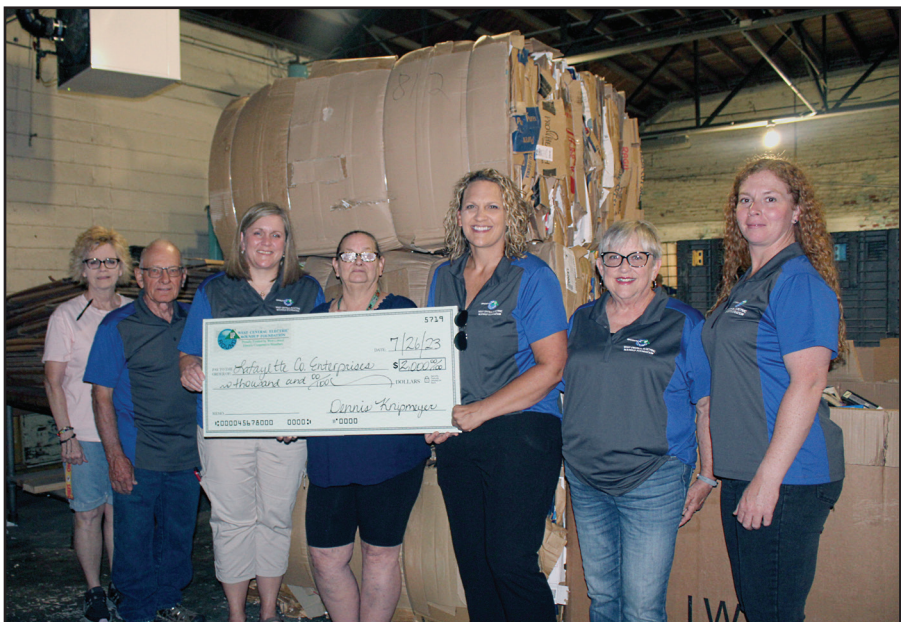
Lafayette County Enterprises