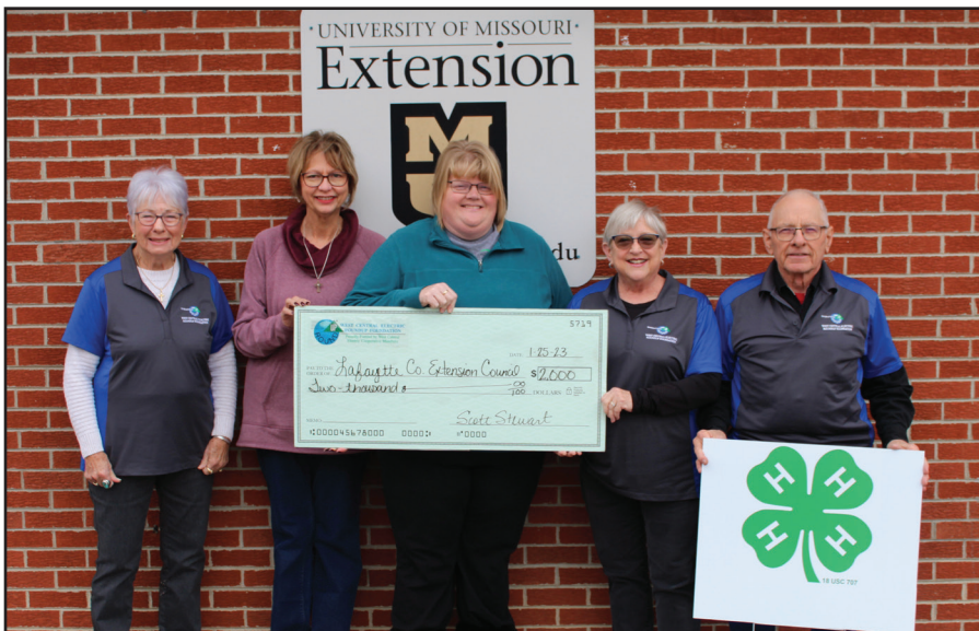
Lafayette County University Extension Council