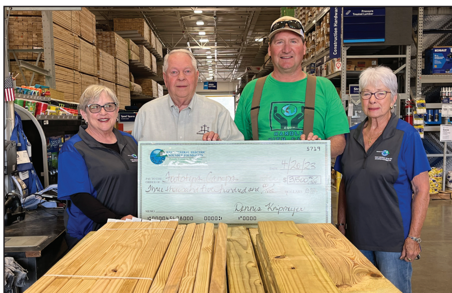
Footsteps Camp, Knob Noster