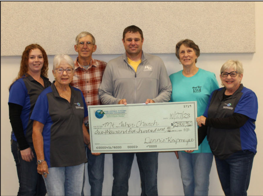
Mt. Tabor Church Floor Covering Project $2,500