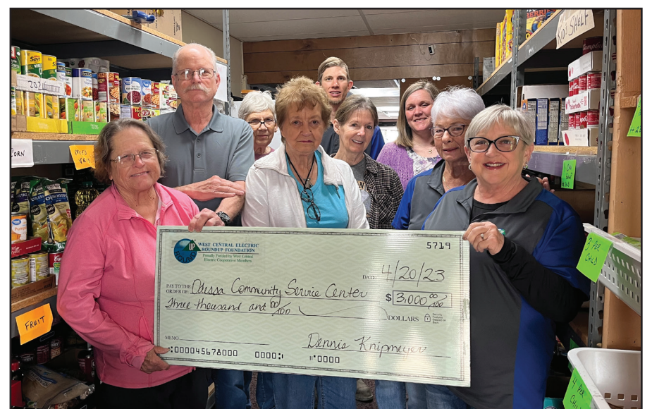
Odessa Community Service Center