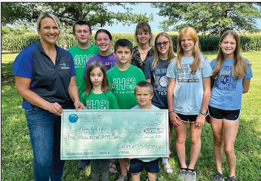
Hitt 4-H Club