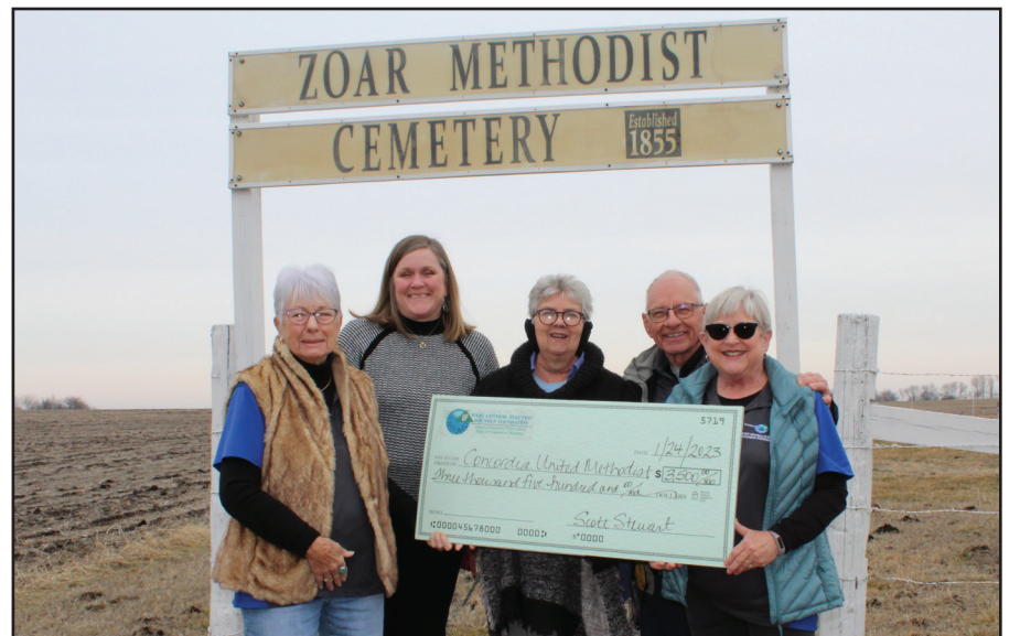
Concordia United Methodist Church