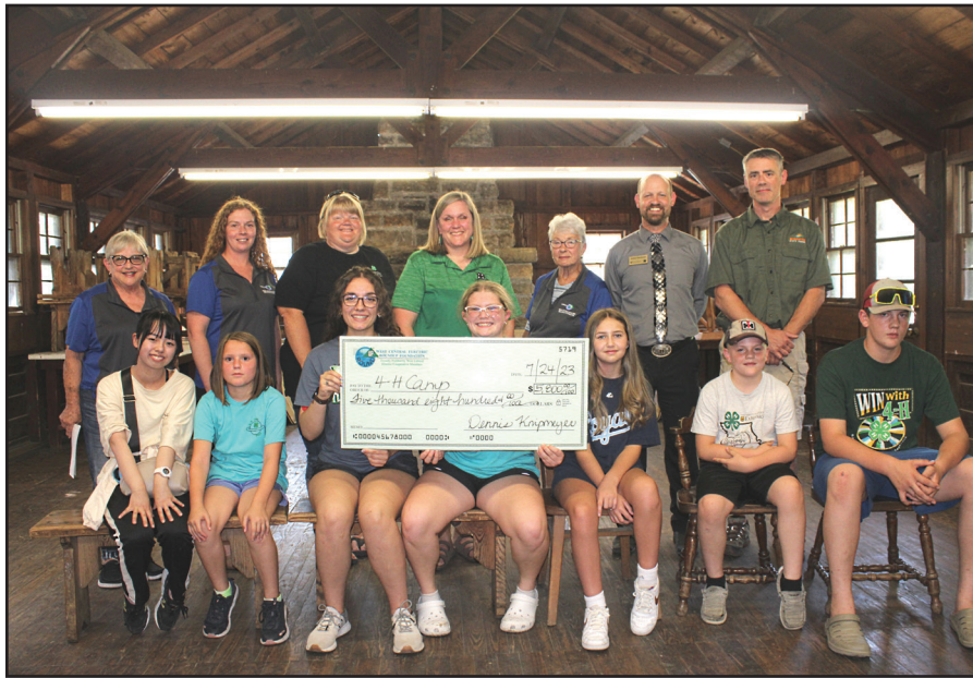
Camp Bobwhite, Knob Noster