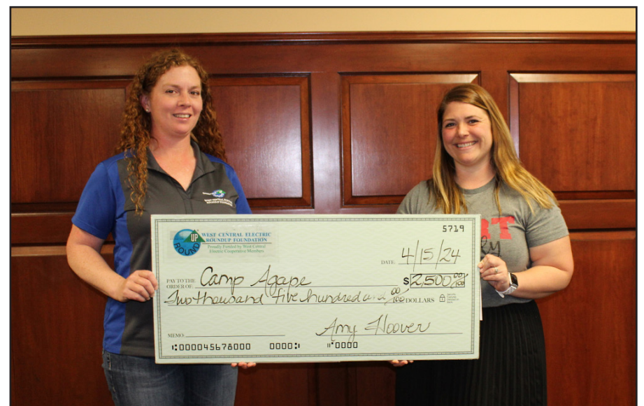
Wellington Comm. Christian Center, Camp Agape