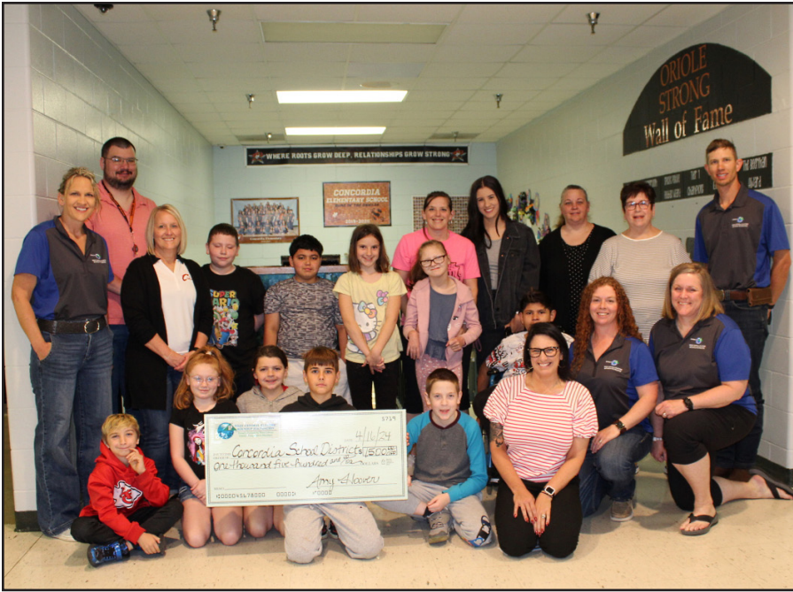
Concordia School District Special Olympics