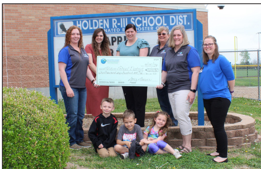
Holden School District