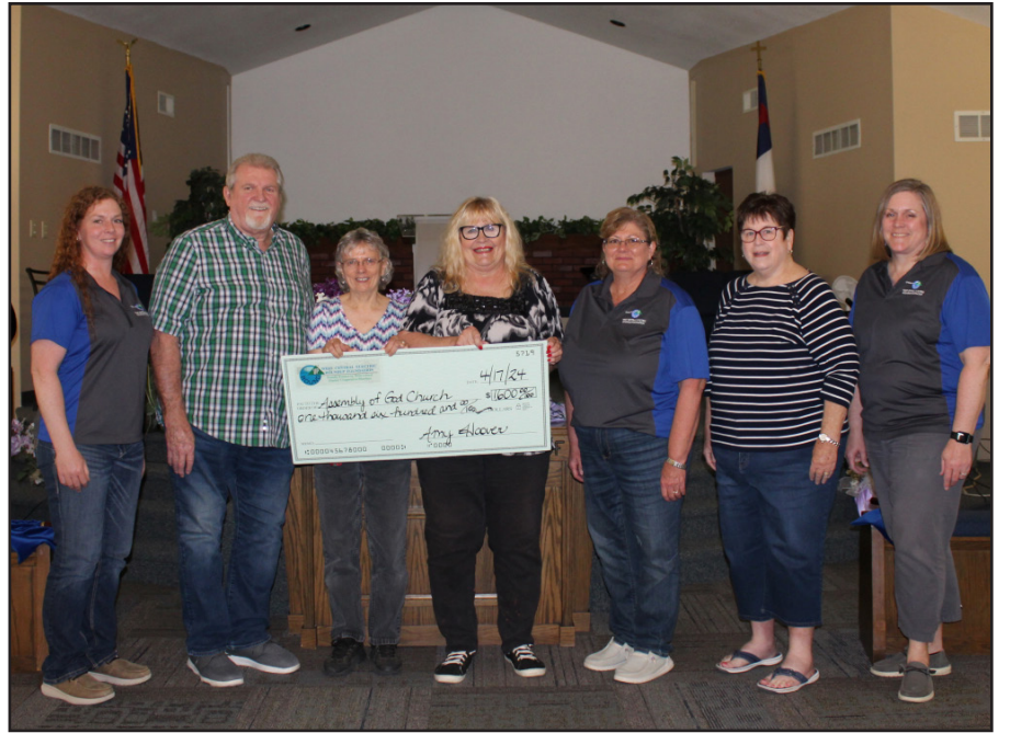
Higginsville Assembly of God 360 Program