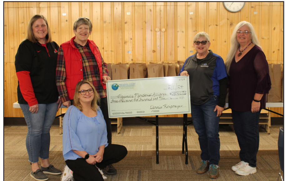
Higginsville Ministerial Fellowship