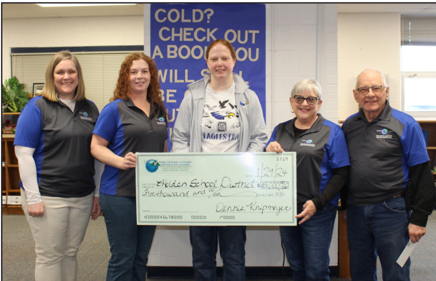
Holden School District