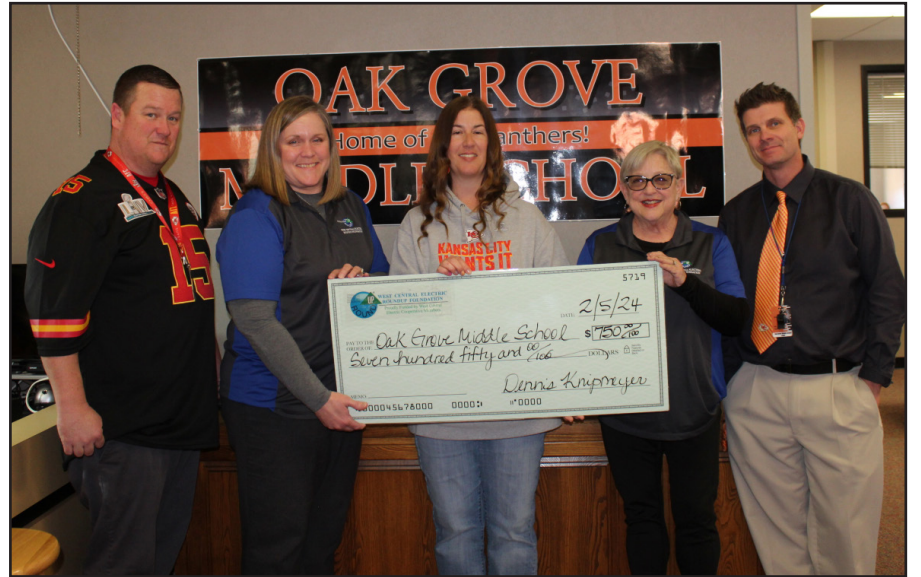
Oak Grove Middle School